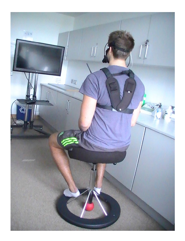
Figure 3. Viewing Station set-up.

of birth) and current ambient conditions. Menstrual cycle phase was not accounted for in this current study.