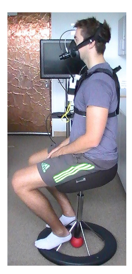
Figure 1. Dynamic Chair.