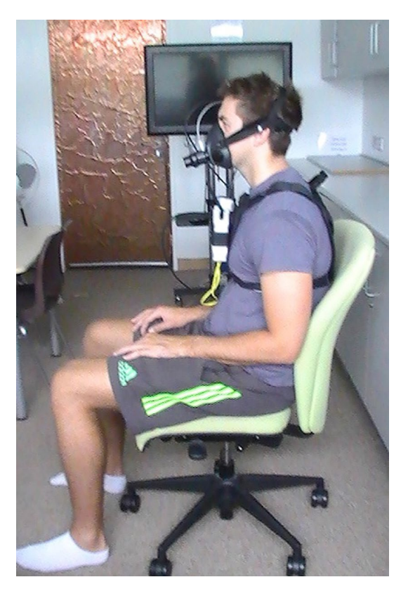
Figure 2. Standard Office Chair.

chair was adjusted to allow a moderate degree of instability (black zone), in line with previous research (O'Sullivan et al. 2012a, 2012b; (O'Keeffe et al. 2013; Curran et al. 2014).