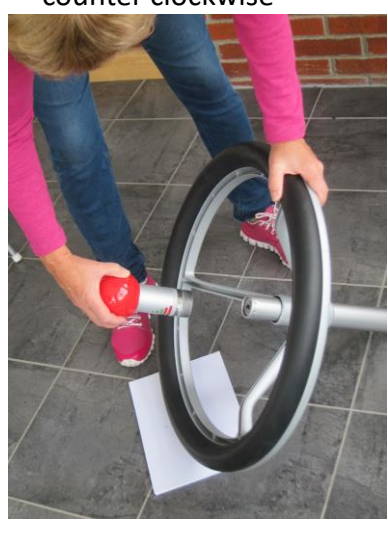
Remove the Magic Ball by turning counter clockwise