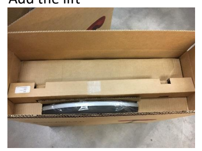
Add the lift