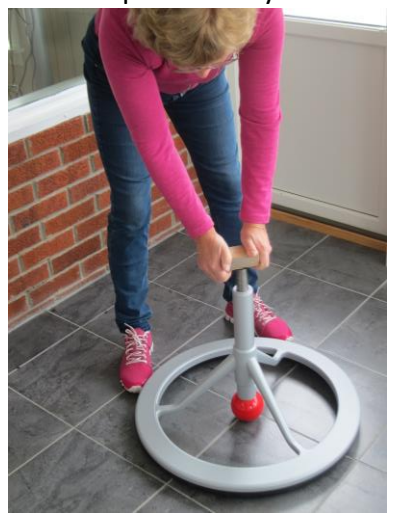
Slide the open end of ball over the pneumatic cylinder and compress the cylinder