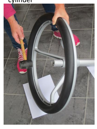
With a plastic hammer knock loose the pneumatic cylinder