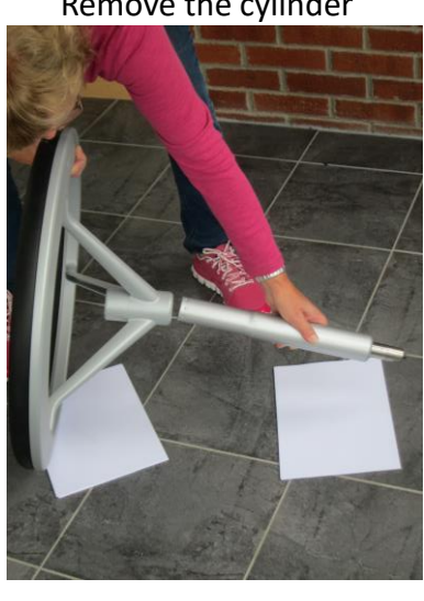
Remove the cylinder