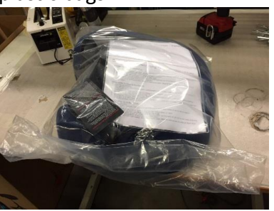
Put the seat and the base in plastic bags