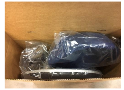
Be sure that the box shape is not damaged