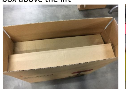
Move the inner part of the box above the lift