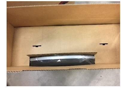
Move the inner part of the box to fix the base