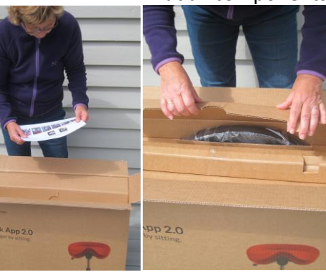
Put all components on the floor and check that all are included